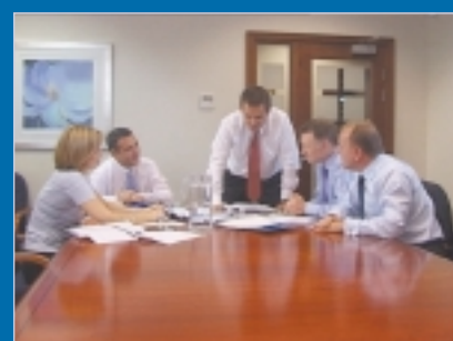
Workshops help to focus the bank’s sales message.